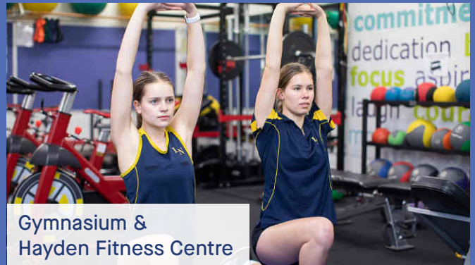
Gymnasium & Hayden Fitness Centre