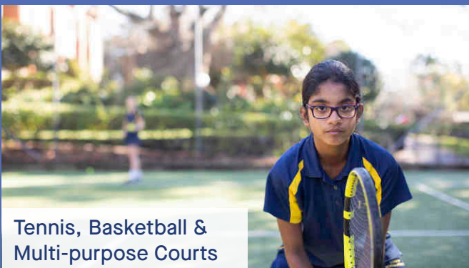
Tennis, Basketball & Multi-purpose Courts