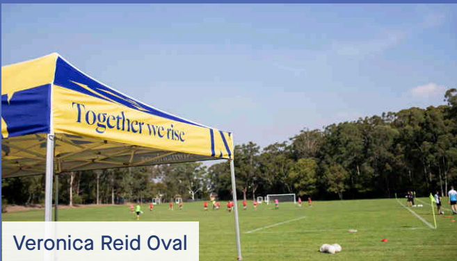
Veronica Reid Oval