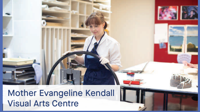
Mother Evangeline Kendall Visual Arts Centre