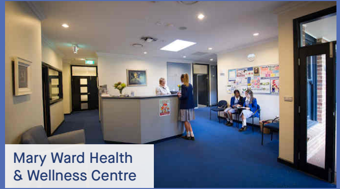
Mary Ward Health & Wellness Centre