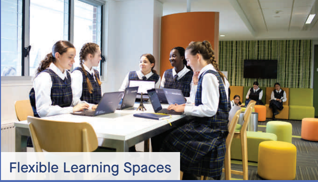
Flexible Learning Spaces