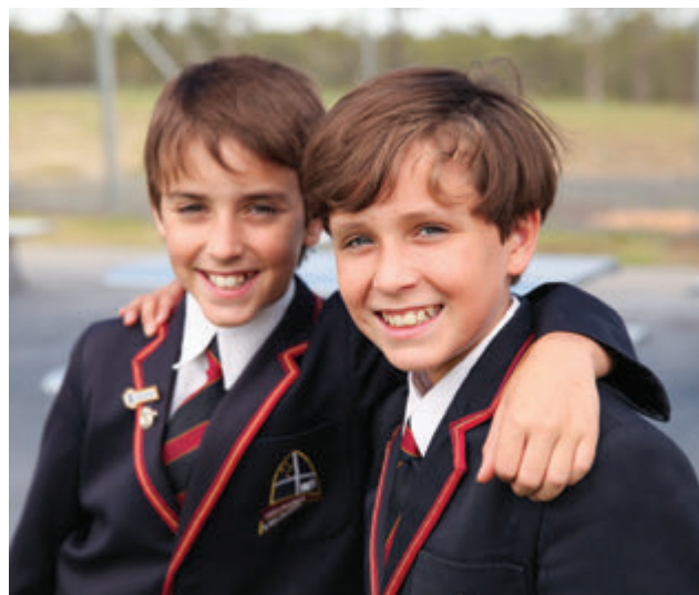
Friendship and camaraderie are key values of the school.

Lakes Grammar Junior School follows the NSW Board of Studies curriculum. The academic emphasis stresses the development of literacy and numeracy skills with the core subjects of Mathematics, English, Science and Technology, Human Society and Its Environment, Personal Development Health and Physical Education, Creative Arts and Christian Studies.