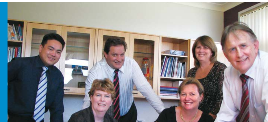
We adopt a team approach at Thomas Hassall Anglican College.