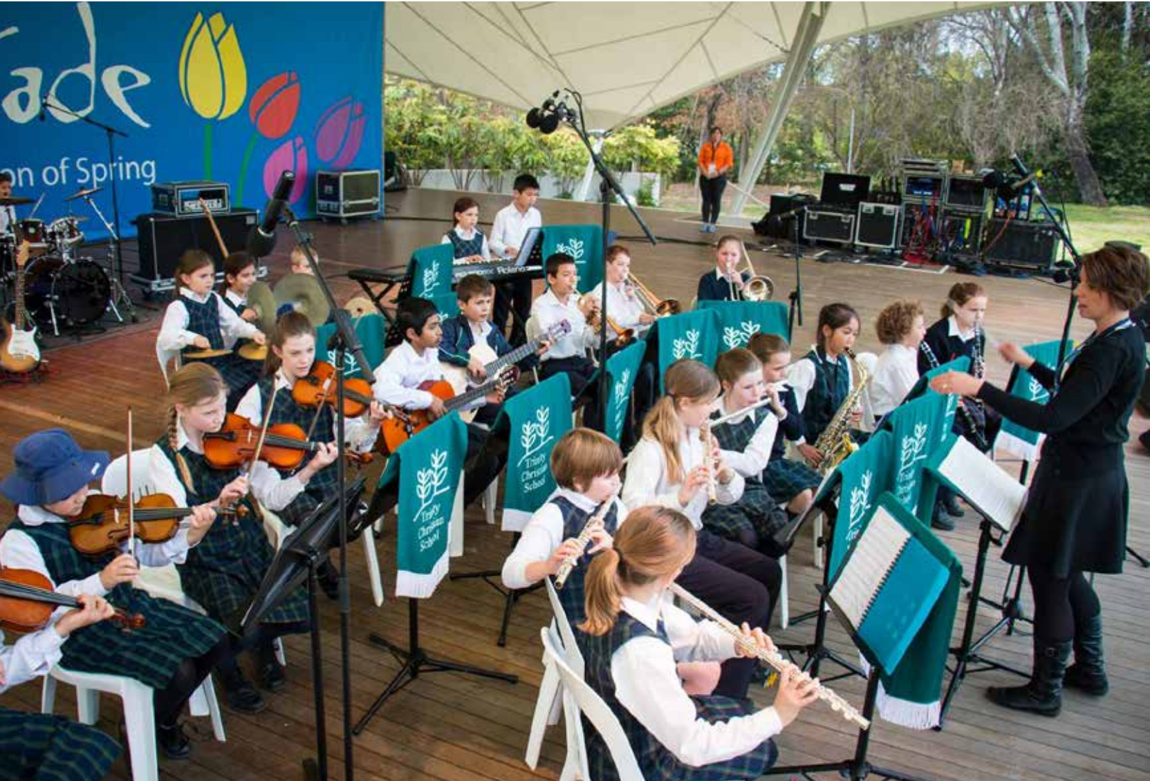
Junior School students performing at Floriade.