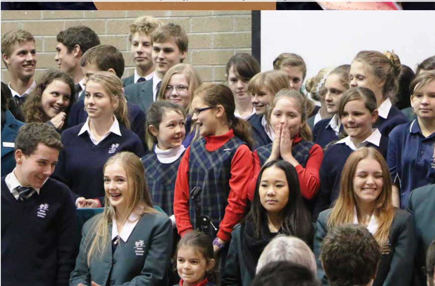
Some of the students who were involved in our school musical production of Seussical™.