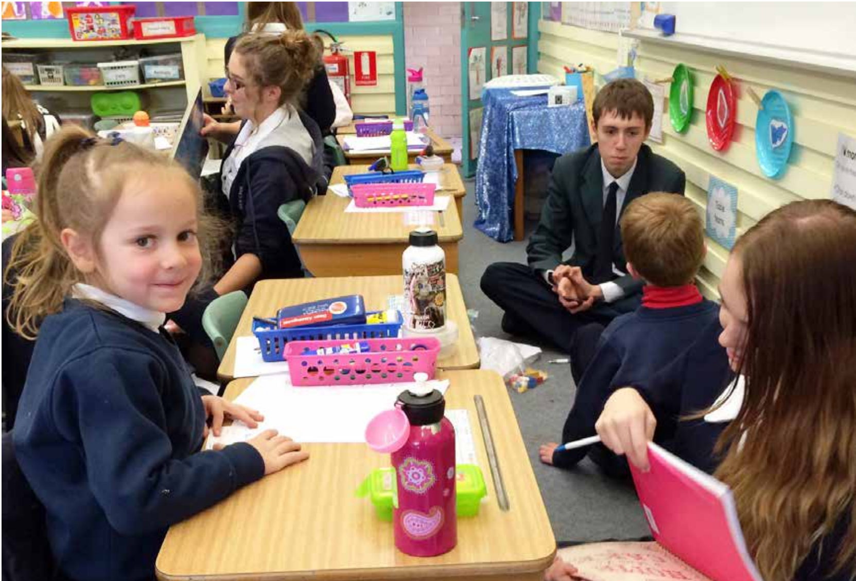
Year 11 and 12 Psychology students testing the Kindergarten students.