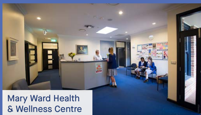
Mary Ward Health & Wellness Centre