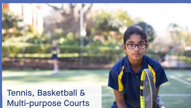
Tennis, Basketball & Multi-purpose Courts