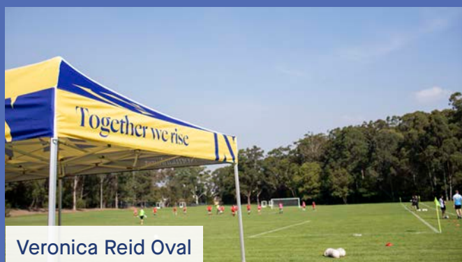
Veronica Reid Oval