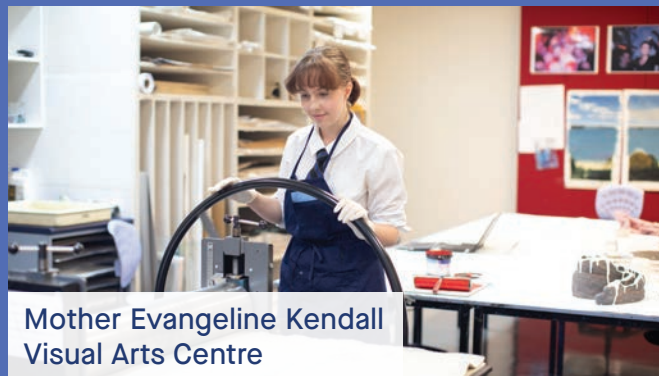
Mother Evangeline Kendall Visual Arts Centre