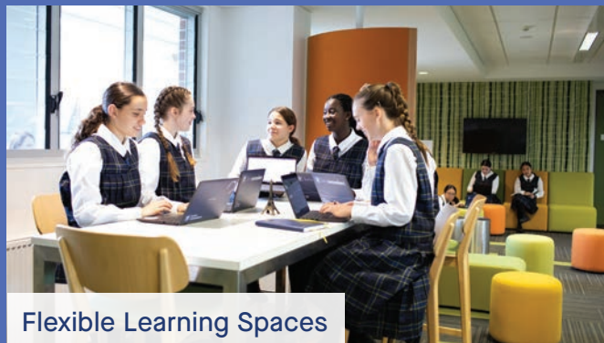
Flexible Learning Spaces