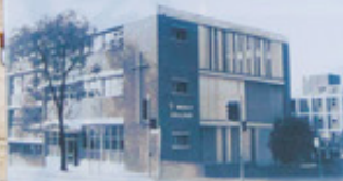
Mercy College 1989