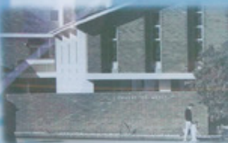
Catholic Girls High School 1965