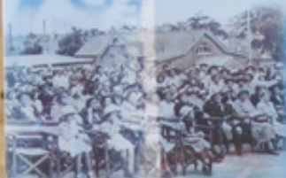
Our Lady of Dolours 1942