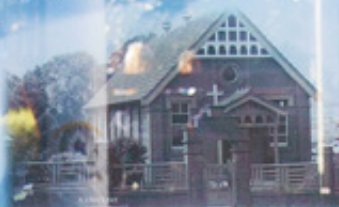
St Catherine's School 1905