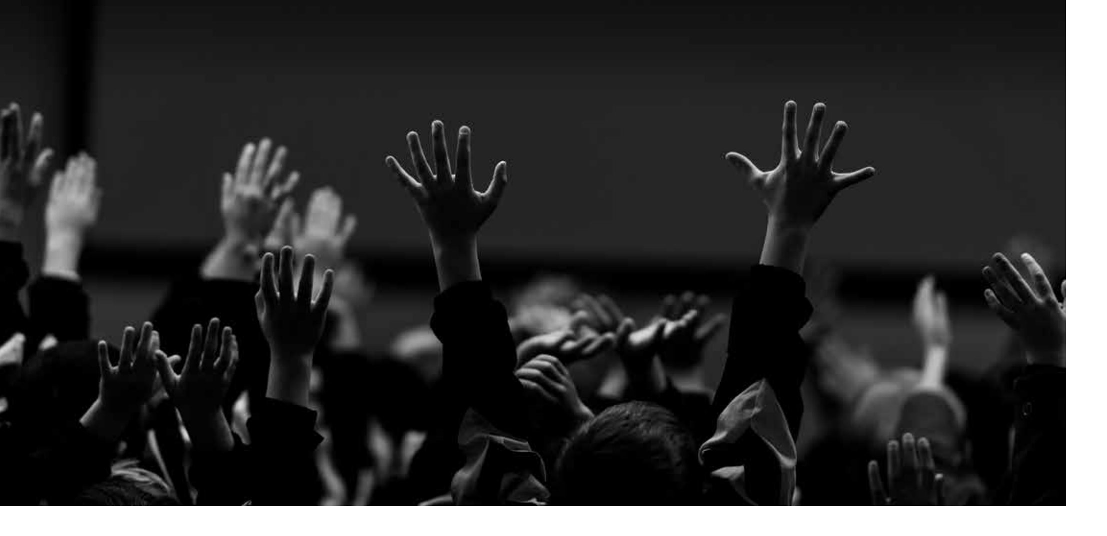
DISCOVER THE BOY WITHIN

Discovery can be internal and external. We guide our boys to look within to learn about their passions, goals and values just as much as we encourage them to look outward to learn about the wider world.