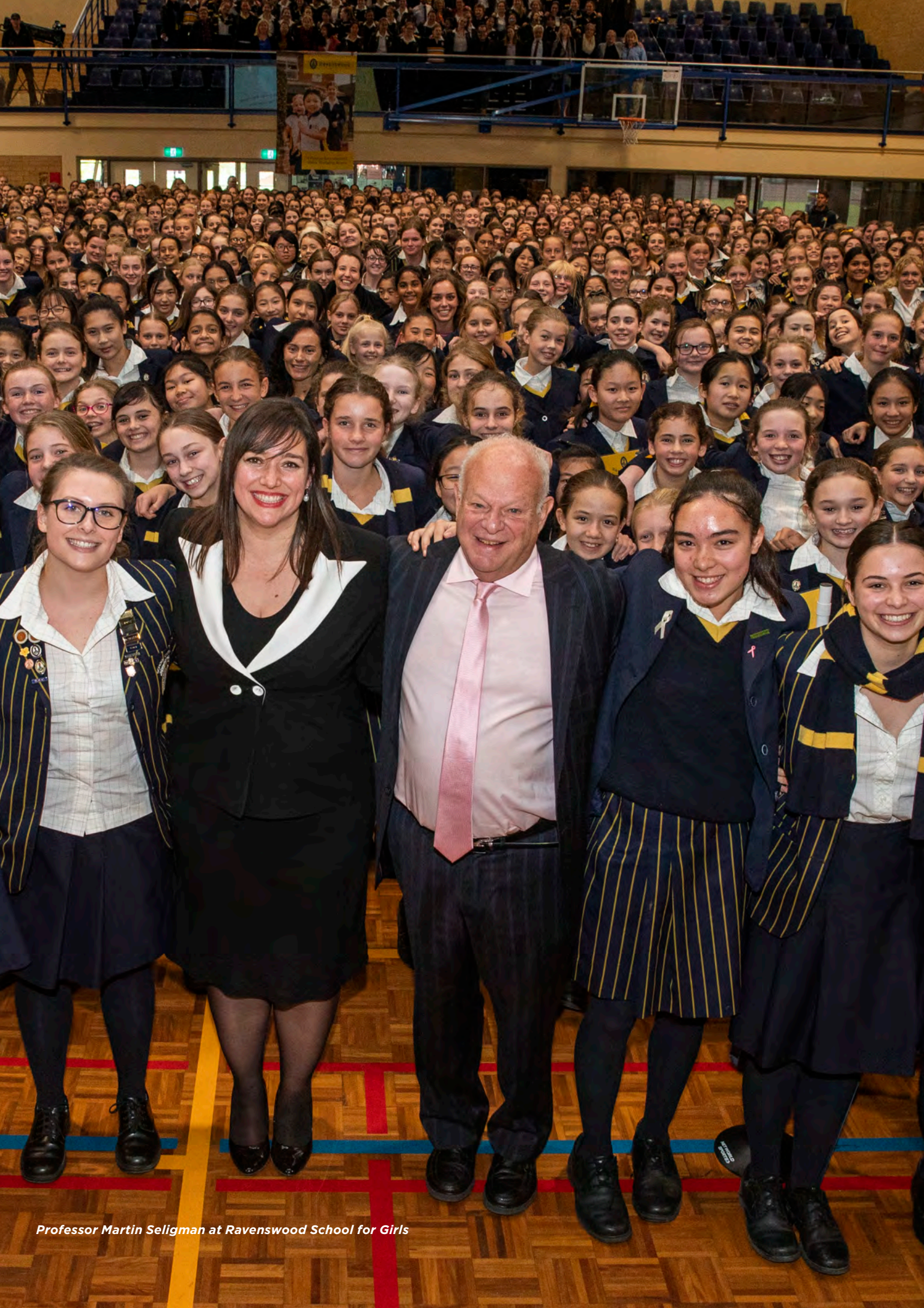
Professor Martin Seligman at Ravenswood School for Girls