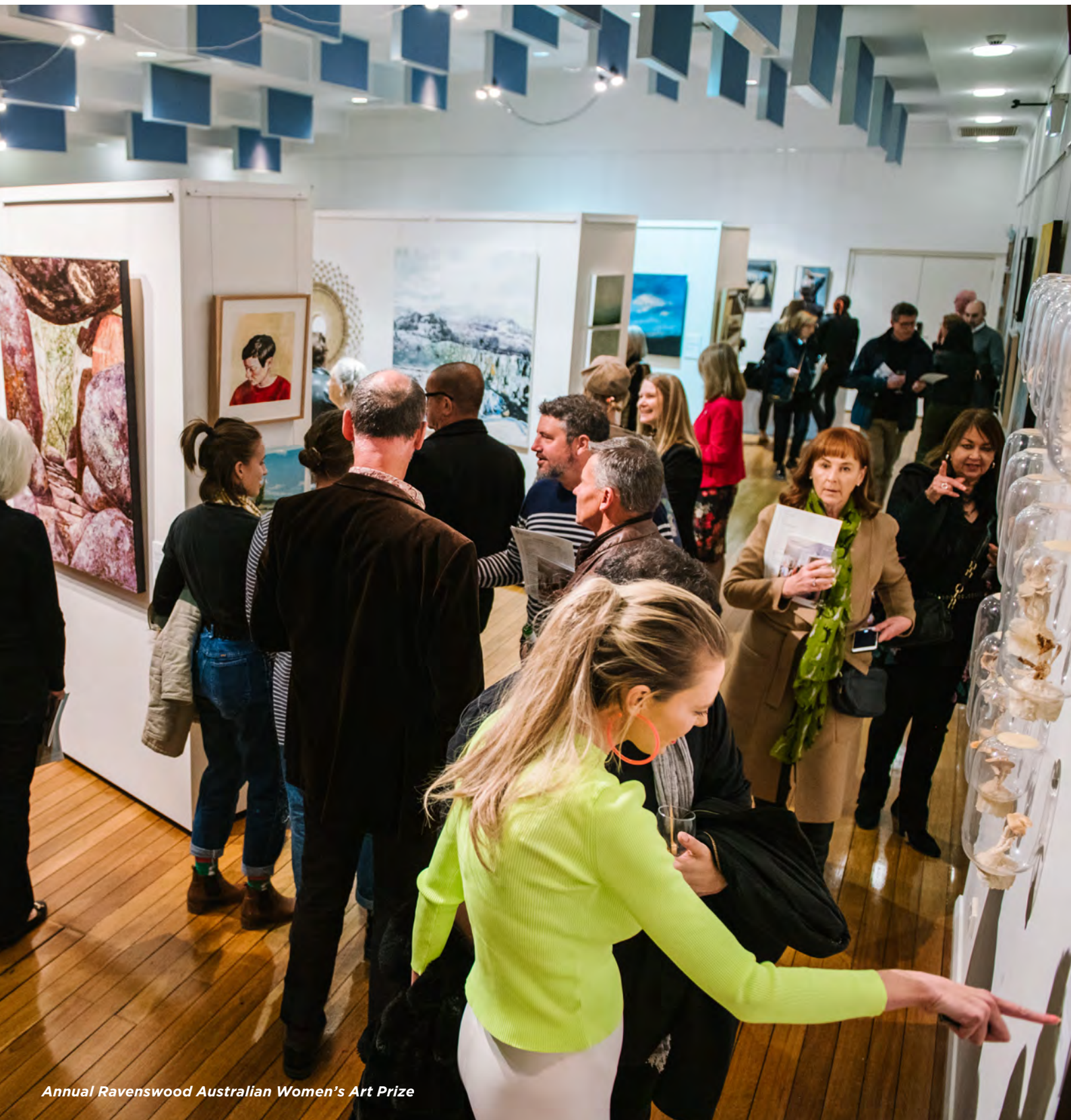
Annual Ravenswood Australian Women's Art Prize