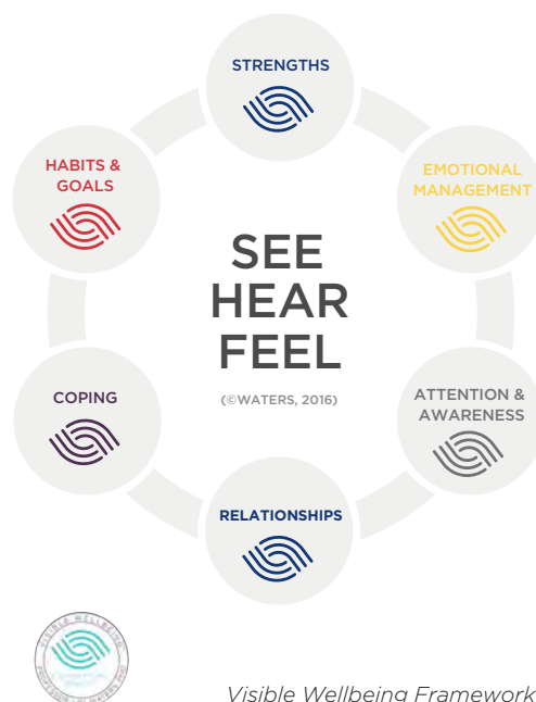
Visible Wellbeing Framework

Our Visible Wellbeing approach and Wellbeing Program form a multi-layered system of support and guidance provided by highly qualified and experienced