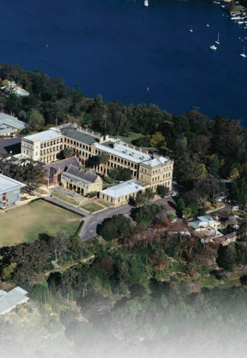
Aerial view of the College Campus, on the Lane Cove River