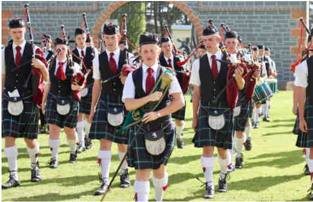
Pipes & Drums