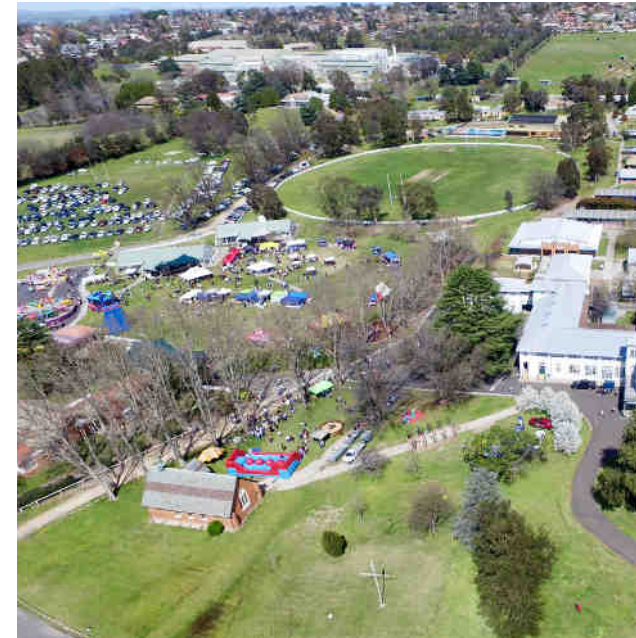
All Saints Campus

College buses transport students daily from the surrounding districts of Millthorpe, Blayney, Kings Plains and Evans Plains.