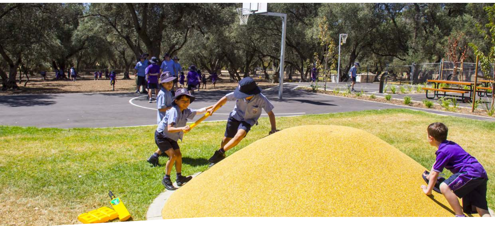
Junior Campus Playgrounds (Wakefield Street - East Parklands)