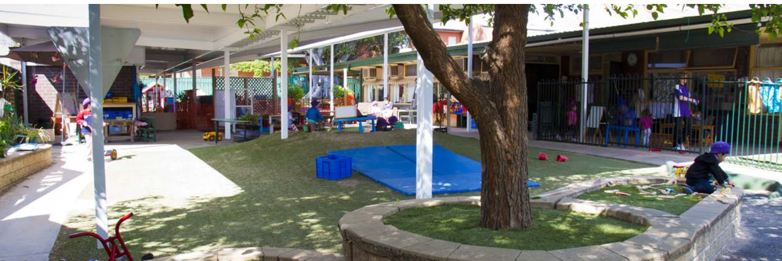
Community Children's Centre