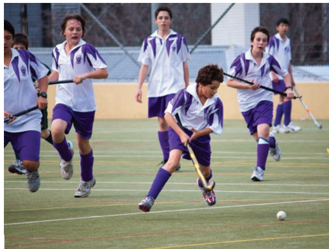
Senior Campus Sportsfield