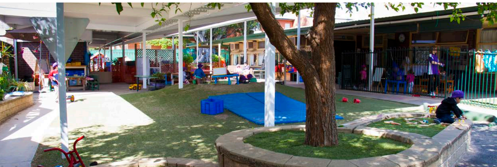
Early Learning Centre