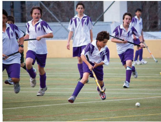
Senior Campus Sportsfield