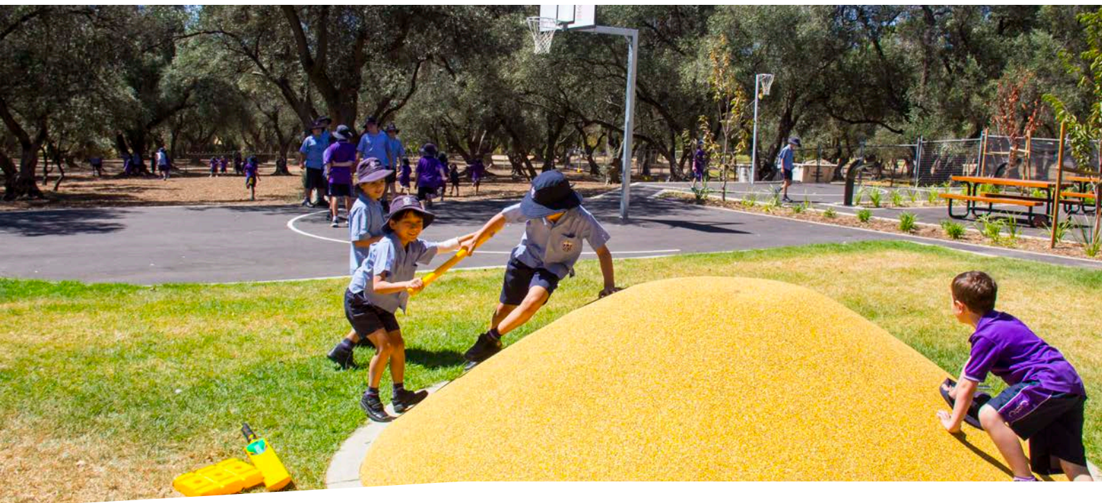
Junior Campus Playgrounds (Wakefield Street - East Parklands)