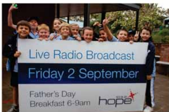
Hope 103.2 Live Broadcast and Father's Day