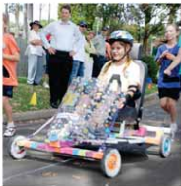
Annual Billy Cart Race