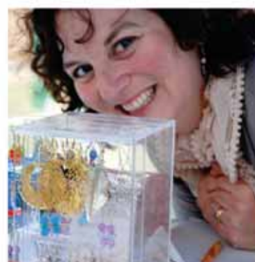
Biggest Morning Tea