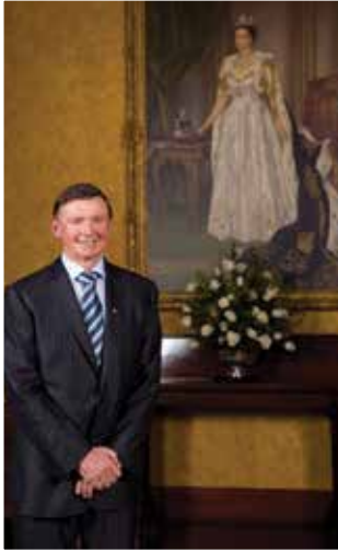
Patron, His Excellency Malcolm McCusker AC CVO QC former Governor of Western Australia and Perth Modern School alumni.

Structured leadership and service opportunities are provided for students. Positions of responsibility are available at a variety of levels – from Student Council representatives to captains of sporting and class groups and peer support leaders.