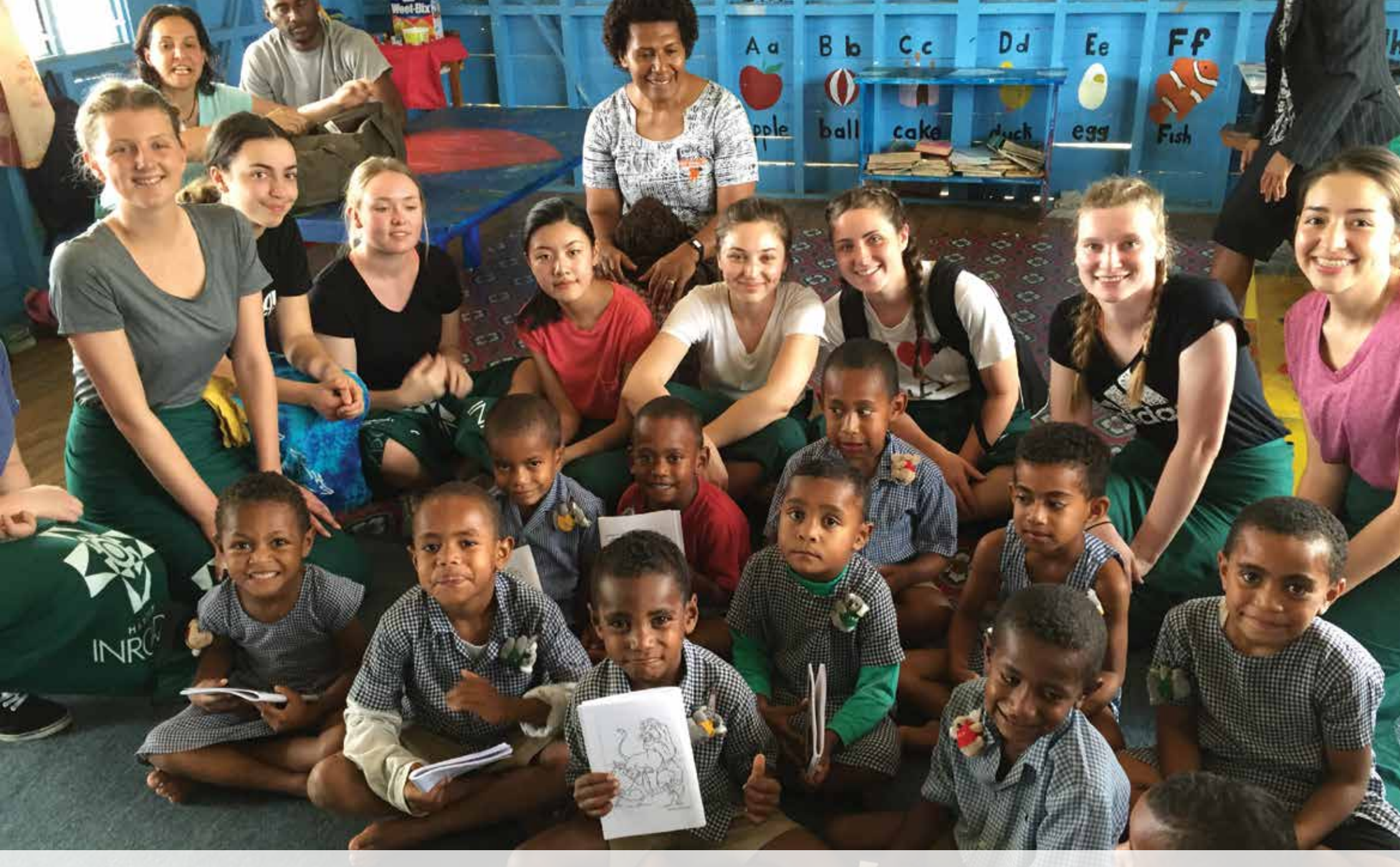
"People in every nation enhance the social dimension of their lives by acting as committed and responsible citizens." (Pope Francis)