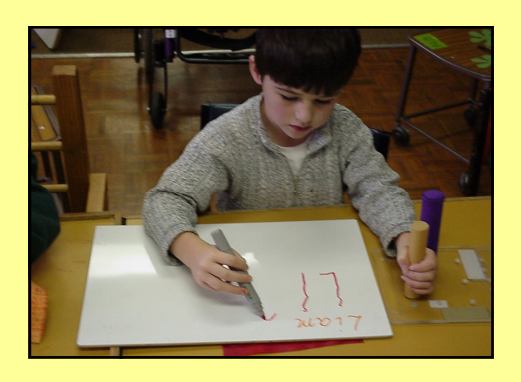
Our role is to help the students to do as much as they can for themselves so that they can be as independent as possible.