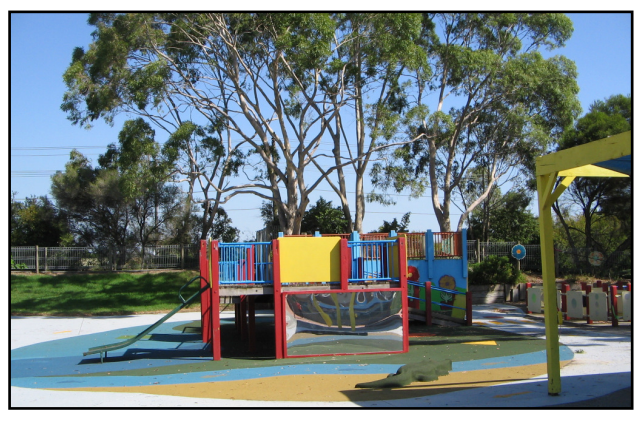
Primary School Playground

A committed team of parents, program assistants and volunteers assist teachers and therapists in a wide range of programs.